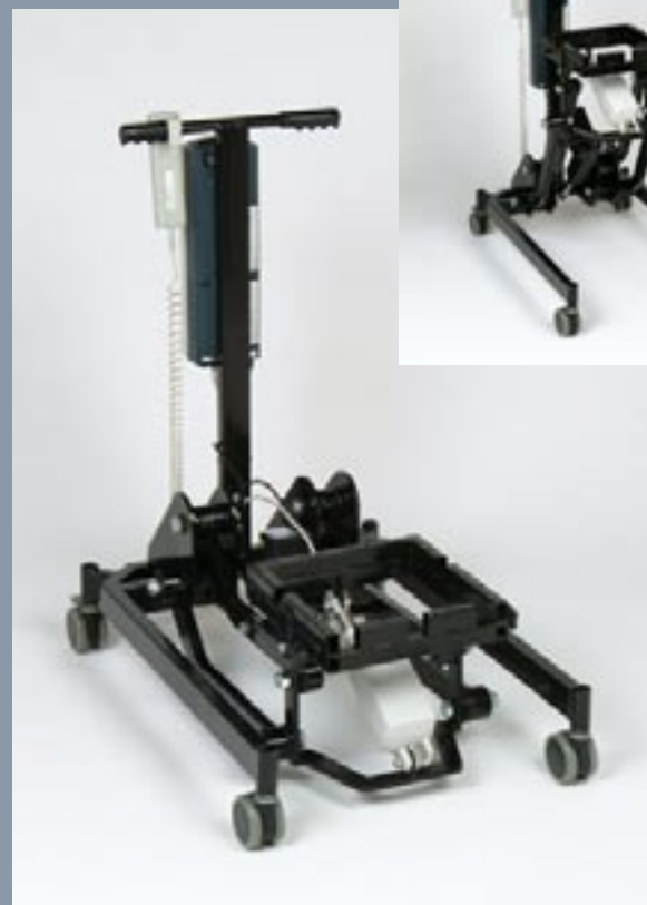
The Multi Ranger Base unit shown in it's lowest and highest positions.