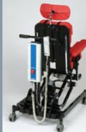
One hand control unit operates both height and tilt adjustment