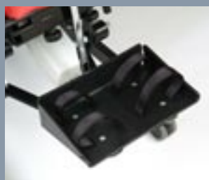
Alternative footrest option.

The Multi Ranger can be used at school or home. It will effortlessly go from floor to above desk height at the touch of a button. All adjustments are operated from a single hand control unit, for ease of use.