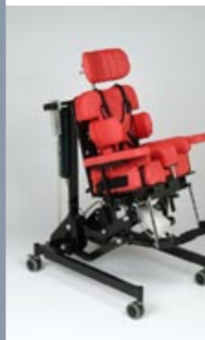
Multi-positional titling facility from upright to 28 degrees