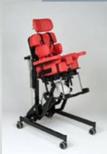
The Multi Ranger fitted with the Tendercare Modular Seating System.