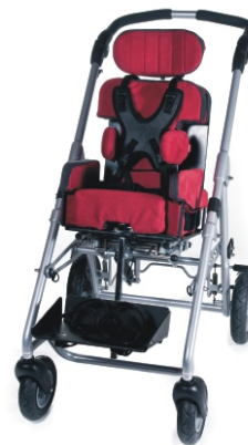
Size 1 With Modular