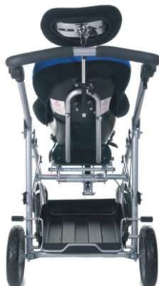
Moulded Seat Rear View