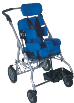
Size 2 With Modular