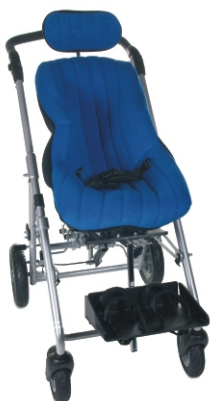
Snappi with Moulded Seat