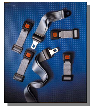
Car Fixing Kit