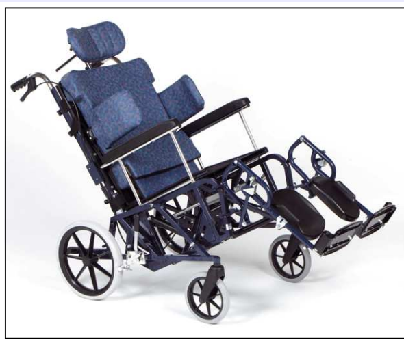
The Tilt & Fold Wheelchair fitted with Thoracic Backboard and Elevating Leg Rests.

We also have the facilities to manufacture bespoke items as required.