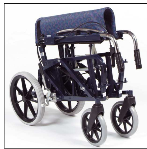
The Tilt & Fold Wheelchair Folded.

The push handles are height adjustable and reversible for the attendant's comfort and ease of use.